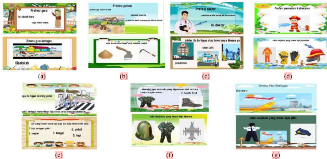
FIGURE 2. Animated videos display examples with many sub-themes in profession: (a) teacher, (b) farmer, (c) doctor, (d) firefighter, (e) police, (f) army, and (g) pilot

Animated videos using sparkol videoscribe are validated by two validators with three assessment aspects, namely construct aspects, content aspects, and language aspects. The feasibility of the animated video developed using sparkol videoscribe has 7 points of assessment of the construct aspect, 6 points of assessment of the content aspect, and 2 points of assessment of the language aspect. The following are the results of the validation of the all aspects of the two validators ( Table I ).