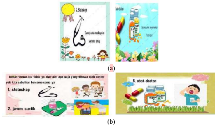
FIGURE 3. Comparisons of animated videos display before and after revisions: (a) before revision (b) after revision.

To find out the practicality of the animated video developed using sparkol videoscribe, the video was assessed by two practitioners with four assessment aspects, namely use aspects, efficiency of learning aspects, attractiveness aspects, and benefits aspects. The practicality of the animated video developed using sparkol videoscribe has 4 points of assessment of the use aspect, 3 points of assessment of the efficiency of learning aspect, 3 points of assessment of the attractiveness aspect, and 3 points of assessment of the benefits aspect. The following are the results of the practicality test from the two practitioners ( Table II ).