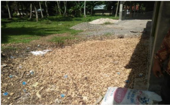
Figure 1. The rest of the harvest in the form of corn cobs piled up in the BUMNag warehouse

From the data in table 1 above, it proves that Nagari Pakandangan is a center for corn plants in the district of Padang Pariaman. The abundance of corn crop production at the same time has an impact on increasing the amount of corn harvest waste. BUMNag Pakandangan which is also engaged in corn production cannot be separated from the presence of this waste. Until now, the remaining corn harvest in the form of corn cobs has only been allowed to accumulate in BUMNag warehouses, as shown in the image below: